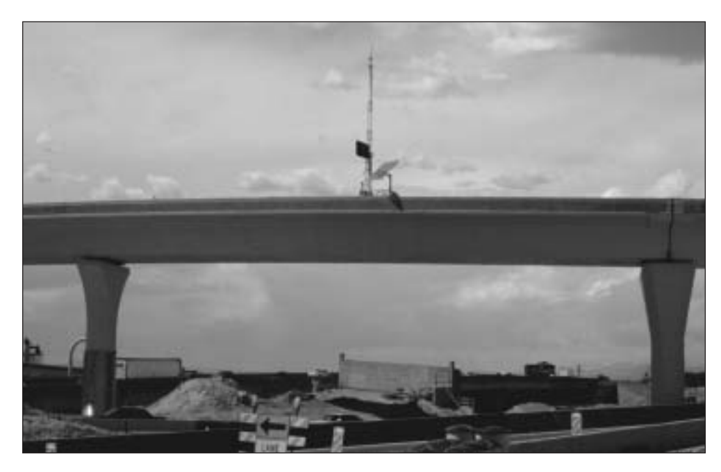
Figure 1 – Example of ITS equipment deployed at the Big I.

For the Big I project, NMSHTD employed ITS in the form of a mobile traffic monitoring and management system to help move the large number of vehicles through the extensive construction area. Mobile traffic monitoring and management systems use electronics and communications equipment to monitor traffic flow and provide delay and routing information to drivers and agency personnel. The ITS application deployed at the Big I in 2000 was used for the duration of the work zone (two years). The ITS components were deployed just prior to construction, with plans to incorporate portions of the system as part of a permanent ITS application for freeway management once construction was completed. Figure 1 shows some of the ITS equipment deployed at the Big I.