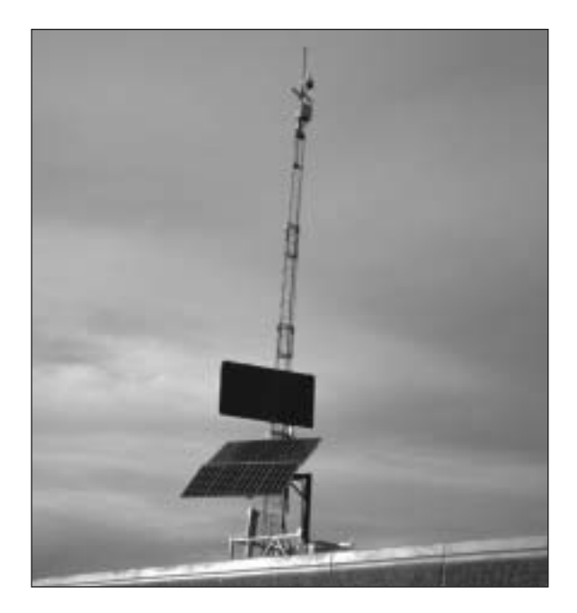
Figure 3 – Solar-Powered Sensors and Communication Equipment