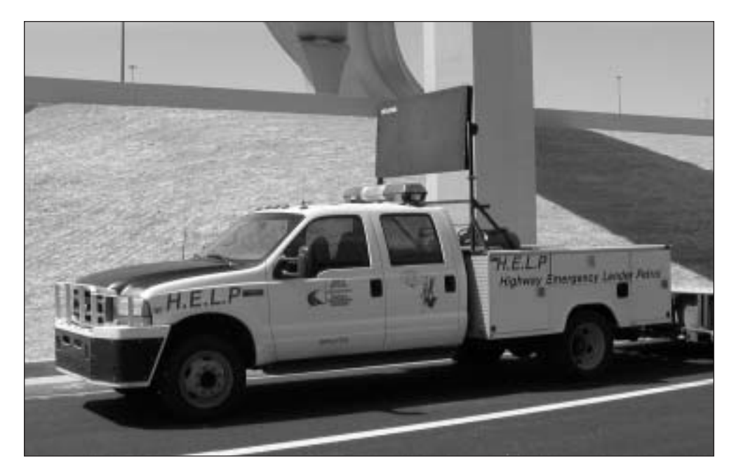
Figure 2 – Highway Emergency Lender Patrol Vehicle

Instituted prior to the Big I project, the Highway Emergency Lender Patrol (HELP) program consisted of two vehicles patrolling the Albuquerque Metropolitan area. NMSHTD recognized that the Big I project would require more HELP trucks. The Federal Highway Administration provided $250,000 toward the purchase of two additional HELP trucks. The additional vehicles were purchased through the construction contract to help patrol the Big I project area during construction. The original two HELP trucks were then able to patrol the rest of the Metro area.