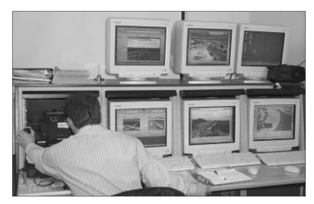
Figure 4 – The Big I TMC