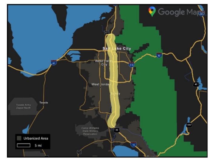
Figure 1. Map. I-15 project segment in Salt Lake City, UT.

Product implementation focused on a 25-mile segment of I-15 in Salt Lake County between milepost 285 to milepost 310 (figure 1). Traversing the highly populated Salt Lake City metropolitan area, this segment experiences high levels of congestion during the morning and evening peak periods.