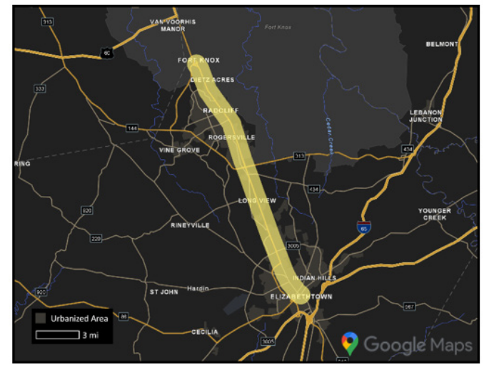
Figure 2. Map. The US 31W project segment between Elizabethtown and Radcliff.