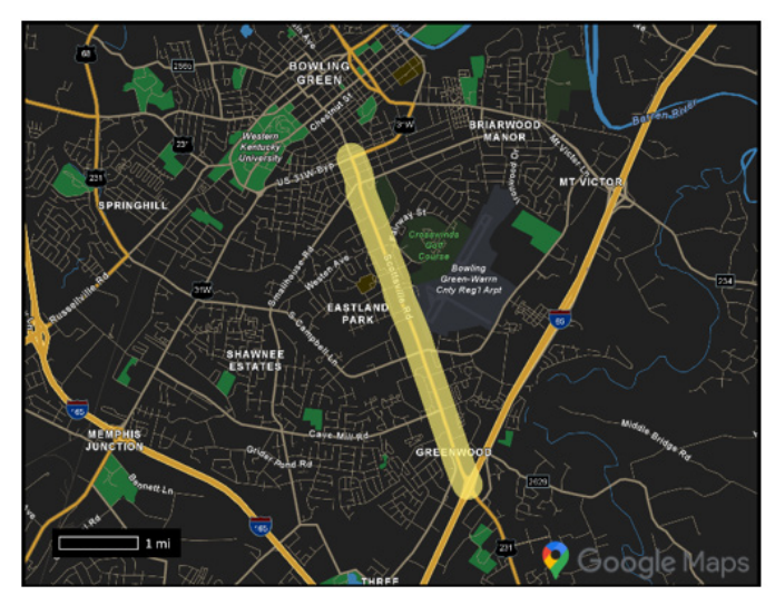
Figure 1. Map. The US 231/231X project segment in Bowling Green.