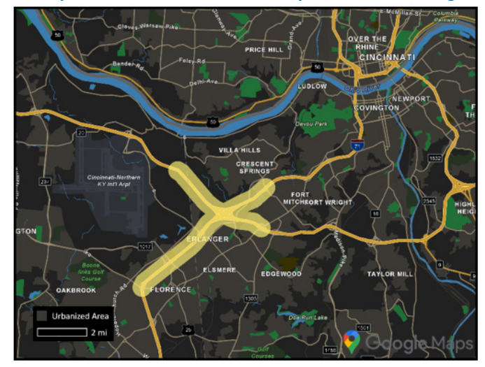
Figure 4. Map. The project interchange between I-275 and I-71/75 in the Cincinnati metropolitan area.