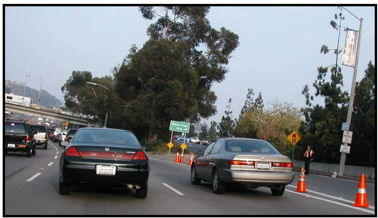
Figure 8-1 Personnel Monitoring of Arterial Ramp Closure