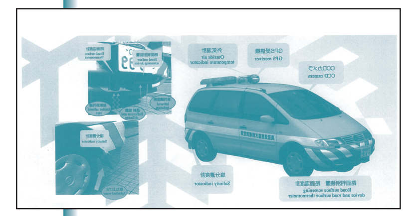
Figure 2. The Japan Highway Public Corporation uses specially equipped patrol vehicles to monitor wintertime road surface conditions.

The information collected by patrol vehicles is transmitted to traffic control centers, which operate 24 hours a day (see Figure 3). The centers also receive road weather information collected by weather observation equipment along the expressways and direct feeds from closed-circuit television (CCTV) cameras at critical locations. The centers then transmit the information to emergency vehicles, winter maintenance vehicles, roadside variable message signs, rest area kiosk terminals, and the highway radio system. Information such as wind speed and air and pavement temperature is displayed digitally on selected roadside message signs on a real-time basis. Vehicle information and communication system (VICS) service has been available on the expressway network since early 1996 to provide road weather information to drivers and passengers through car navigation systems installed in vehicles.