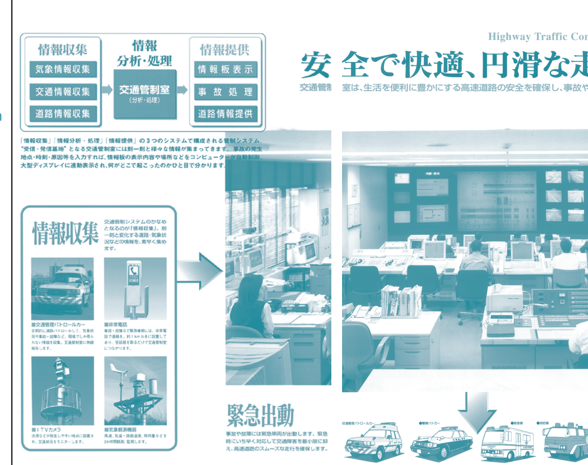
Figure 3. Traffic control centers in Japan collect information on winter road conditions and retransmit it to maintenance vehicles, variable message signs, and rest area kiosks.

The information collected by patrol vehicles is transmitted to traffic control centers, which operate 24 hours a day (see Figure 3). The centers also receive road weather information collected by weather observation equipment along the expressways and direct feeds from closed-circuit television (CCTV) cameras at critical locations. The centers then transmit the information to emergency vehicles, winter maintenance vehicles, roadside variable message signs, rest area kiosk terminals, and the highway radio system. Information such as wind speed and air and pavement temperature is displayed digitally on selected roadside message signs on a real-time basis. Vehicle information and communication system (VICS) service has been available on the expressway network since early 1996 to provide road weather information to drivers and passengers through car navigation systems installed in vehicles.