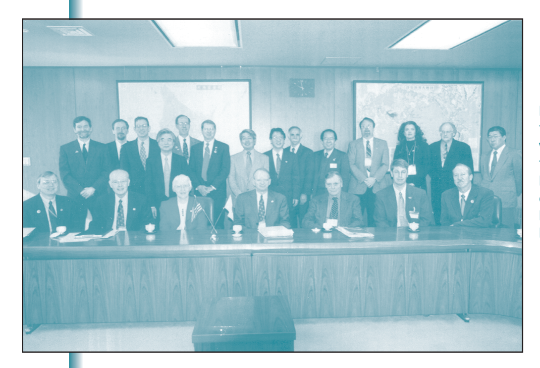
Figure 1. U.S. scanning team members meet with representatives of the Hokkaido Regional Development Bureau and Civil Engineering Research Institute of Hokkaido.

Prefecture Department of Construction, City of Sapporo Development and Construction Department, and CERI. The purpose of this meeting was for our Japanese hosts to provide answers to the amplifying questions listed in Appendix A. These questions covered six areas of interest to the scanning team: