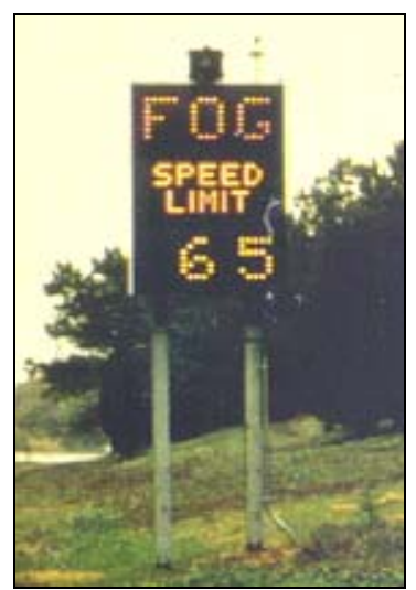
Figure 3 – VSL Sign

In December, 1990 a 99-vehicle collision on Interstate 75 in southeastern Tennessee prompted the design and deployment of a fog detection and warning system. The system covers a threemile, fog-prone section above the Hiwassee River and eight-mile road sections on each side of the river. A central computer system predicts and detects conditions conducive to fog formation by continually monitoring data from two environmental sensor stations (ESS), eight fog detectors and 44 vehicle speed detectors. The computer system alerts traffic and emergency managers when established threshold criteria are met, correlates field sensor data with predetermined response scenarios, and recommends responses based upon prevailing field conditions.