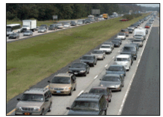
Figure 2 – Contraflow During Evacuation

Traffic and emergency managers quickly developed a contraflow plan for reentry operations. Westbound lanes were reversed for use by coastbound traffic and portable DMS and highway advisory radio (HAR) transmitters were deployed along the interstate to alert drivers. As a result, the maximum volume during reentry was 2,082 vehicles per hour per lane—a 49% increase over the peak evacuation volume. Evacuation traffic management improved mobility by significantly increasing roadway capacity and traffic volume. (12)