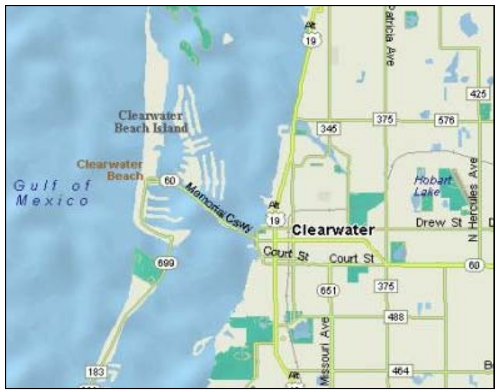
Figure 1 – City of Clearwater Map

Memorial Causeway (i.e., Route 60). When a rain gauge installed on the beach detects a predetermined amount of rainfall, the signal system computer issues a command to downtown traffic signals to implement timing plans with longer green times for inbound approaches. Vehicle detectors on the Memorial Causeway (shown in Figure 1) measure the density of traffic queues. When traffic volumes return to normal levels, the computer restores normal timing plans. Mobility is enhanced by modifying traffic signal timing to prevent traffic congestion during rain events. (10)