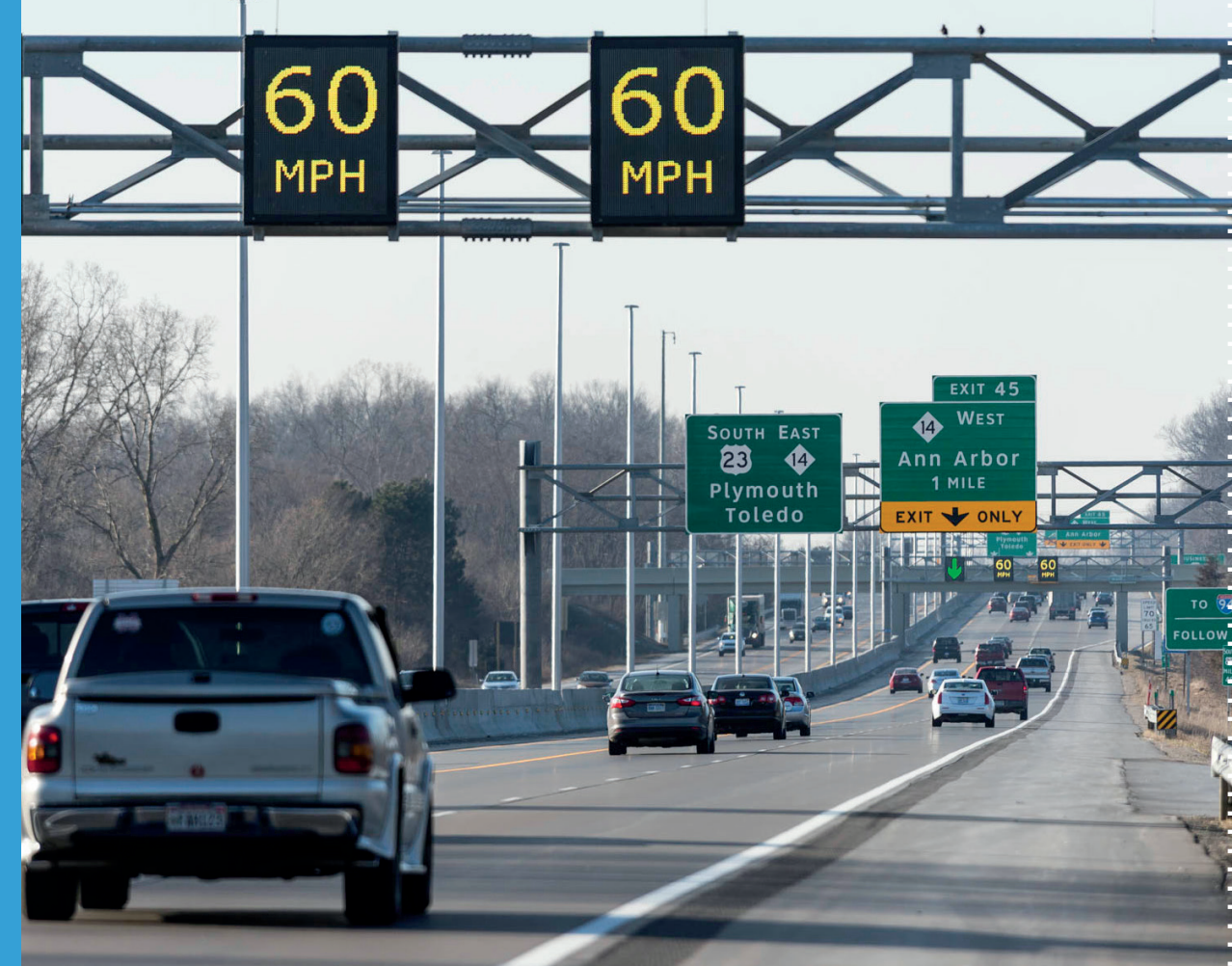
Michigan’s US-23 Flex Route, opened in 2017 north of Ann Arbor, utilizes active traffic management to address traffic, incident management, and motorist safety.