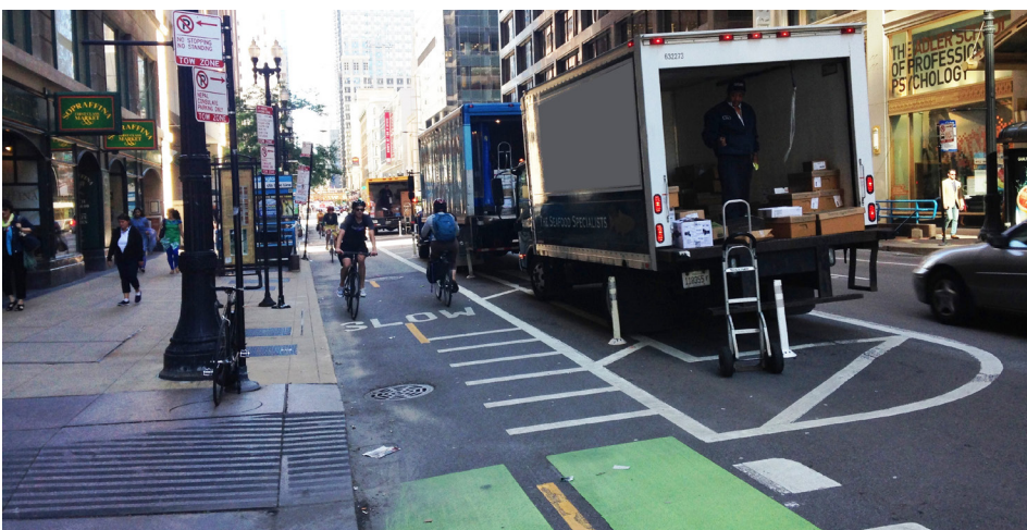
Figure 1. Delivery trucks unloading along a protected bike lane, with the truck opening into a hatched No Parking area.