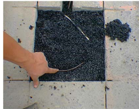
Figure AK-3. Top sensor on a wire lead.

The probes have been manufactured by Measurement Research Corporation (MRC). MRC is only providing a limited number of TDP units, so ADOT&PF is diligently searching for another supplier for future years. Each probe has a lead-in data cable and a 6-foot thermistor string, one-inch diameter, encased in an epoxy resin. Figure AK-1 shows the 6-foot thermistor string with the top “pig-tail” thermistor featured in the inset. The MRC probe is installed vertically through the pavement in a hole, which is normally drilled through the shoulder of the road, as shown in Figure AK-2. The hole is back-filled with sand and capped with asphalt pavement.