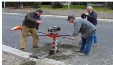
Figure AK-2. Boring hole for temperature probe.