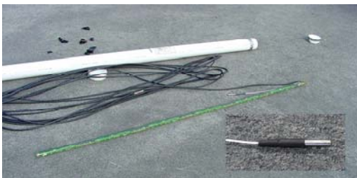
Figure AK-1. Thermistor string and temperature probe casing.

System Components: The temperature probe program started with the Northern Region Fairbanks Research Section more that 20 years ago. In 1990 there was a coordinated effort to install statewide permanent data recorders and collect telemetry. The TDP program continues with new installations as construction projects and funding allows. There are over 75 sites around the state where TDP are installed in the road section.