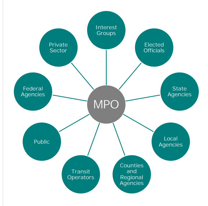
Figure 1: MPO Representation. Adapted from <a href="http://www.bikeleague.org/sites/default/files/MPO_FAQ.pdf">http://www.bikeleague.org/sites/default/files/MPO_FAQ.pdf</a>

With most MPOs, the governing body appoints a technical committee that, along with its subcommittees, makes key transportation recommendations for the MPO region. Figure 2 is an example of the decision making process.