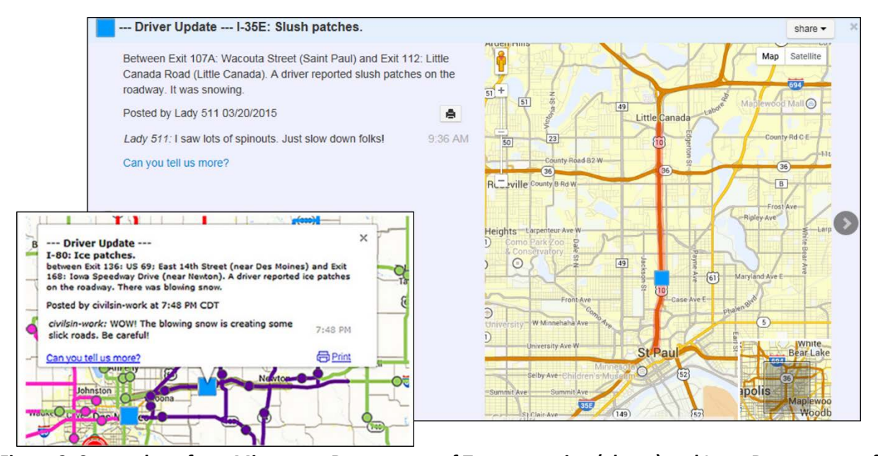
Figure 2. Screenshots from Minnesota Department of Transportation (above) and Iowa Department of Transportation (inset)