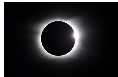
Figure 1. Image of a total solar eclipse.