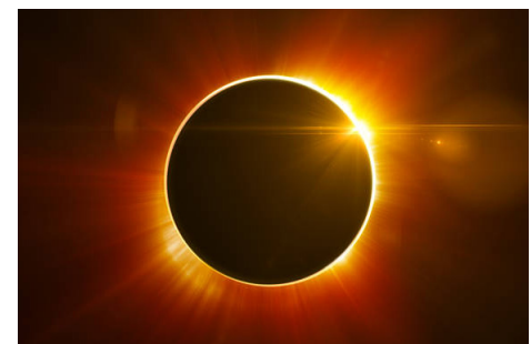
Figure 3. Image of an annular solar eclipse.

Hybrid Solar Eclipse: The rarest type of eclipse is when a total eclipse changes to an annular eclipse, or vice versa, along the eclipse path.