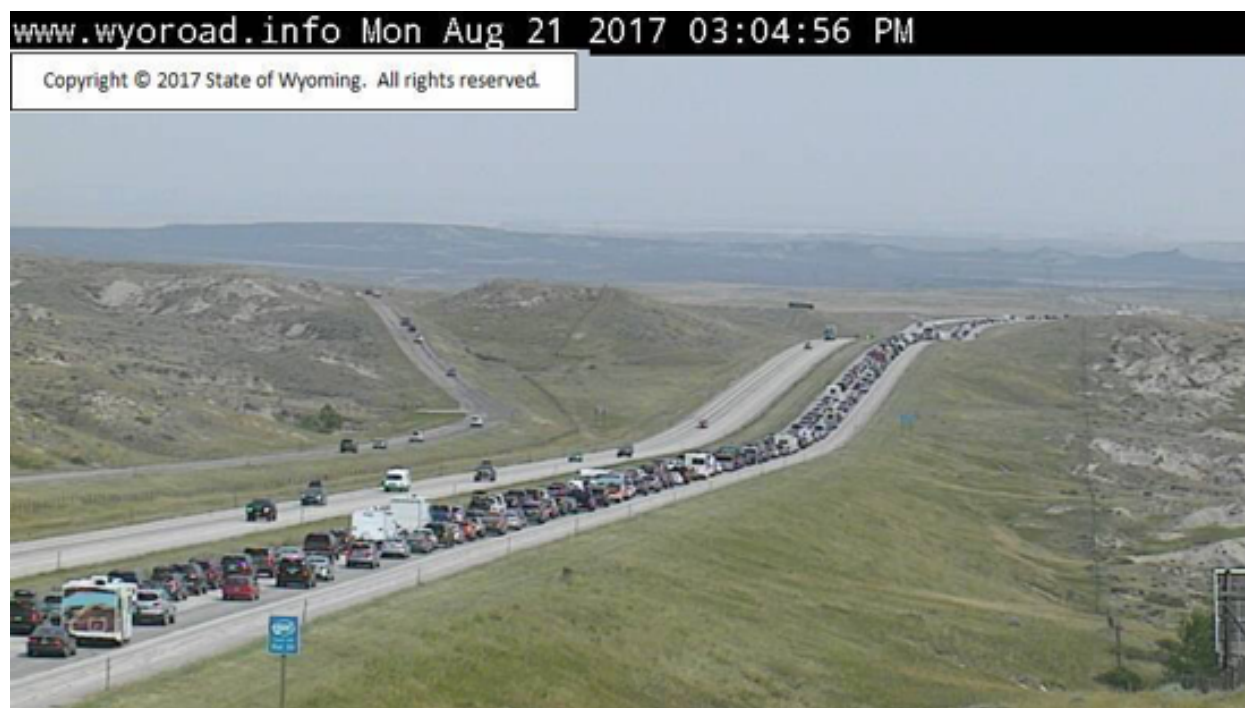
Figure 4. The 2017 total solar eclipse caused significant traffic delays on rural interstates in Wyoming.

Similarly, the path of the 2024 total solar eclipse will cross rural areas, although in close proximity to major population centers, such as Houston, TX, New York City, NY, and Boston, MA. For optimal viewing, many people from these large cities will travel to nearby rural areas to view the 2024 solar eclipse. Major cities like Dallas, TX and Cleveland, OH are also in the path of the 2024 total solar eclipse, and these areas may be more capable of handling an influx of travelers wishing to view the eclipse.